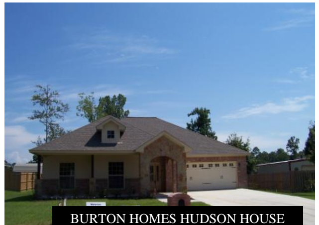
BURTON HOMES HUDSON HOUSE