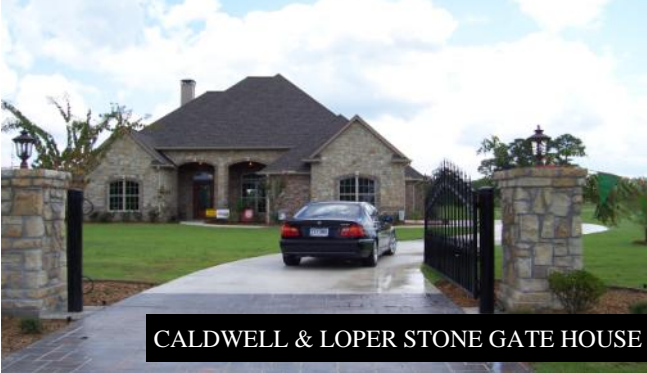
CALDWELL & LOPER STONE GATE HOUSE