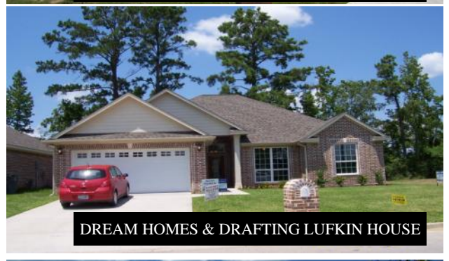
DREAM HOMES & DRAFTING LUFKIN HOUSE