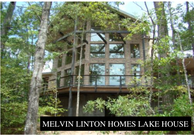
MELVIN LINTON HOMES LAKE HOUSE