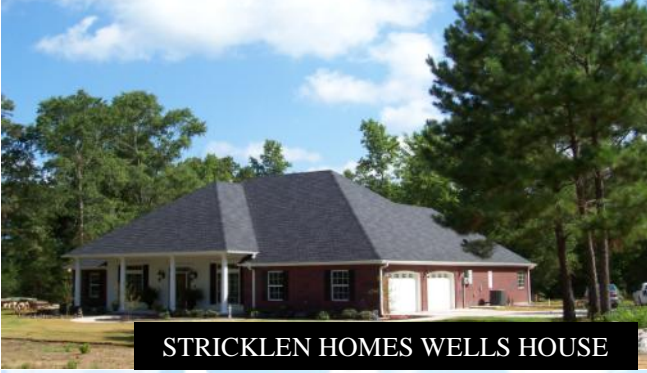
STRICKLEN HOMES WELLS HOUSE