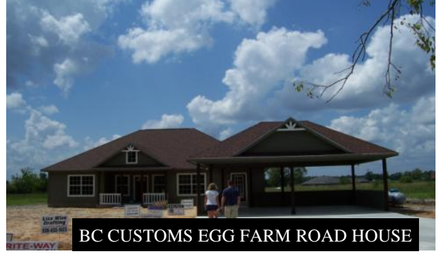
BC CUSTOMS EGG FARM ROAD HOUSE