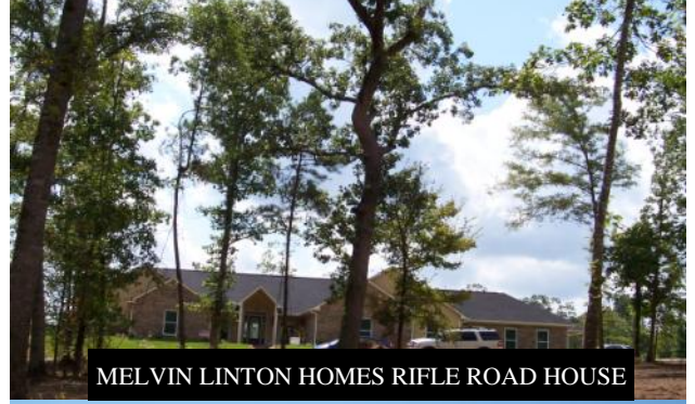
MELVIN LINTON HOMES RIFLE ROAD HOUSE