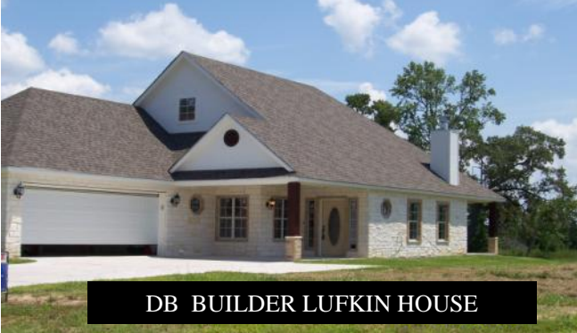
DB BUILDER LUFKIN HOUSE