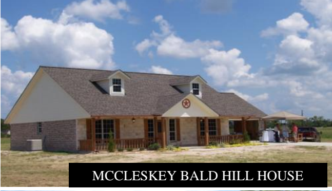
MCCLESKEY BALD HILL HOUSE