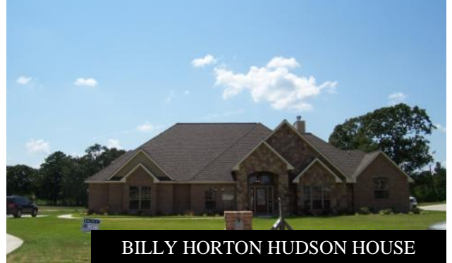
BILLY HORTON HUDSON HOUSE